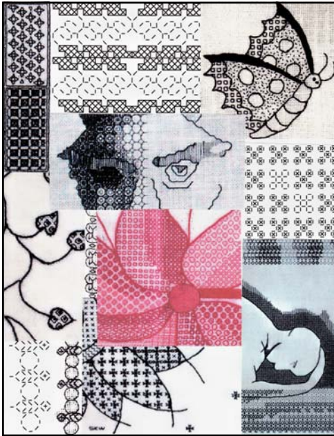
Collage: Patterns to Art